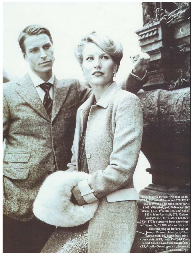
Man: Harris tweed Princess coat, £796; Elspeth Gibson tel 020 7235 0661; tweed & brocade cardigan, £145; Whistler's gold V-neck shirt, dress, £138; Marella tel. 020 7287 3434; fake fur muff, £75; Calver and Wilson, for orders tel. 020 7724 6771; diamond bow earrings with pearls, £3,300, 40c watch and cocktail ring as before all at Joseph Bonnar; Hims: grey/llac tweed suit, £218; pale pink check shirt, £78, both Etrusca Old Bond Street, London; purple tie, £35, Adolfo Dominguez at Jenners