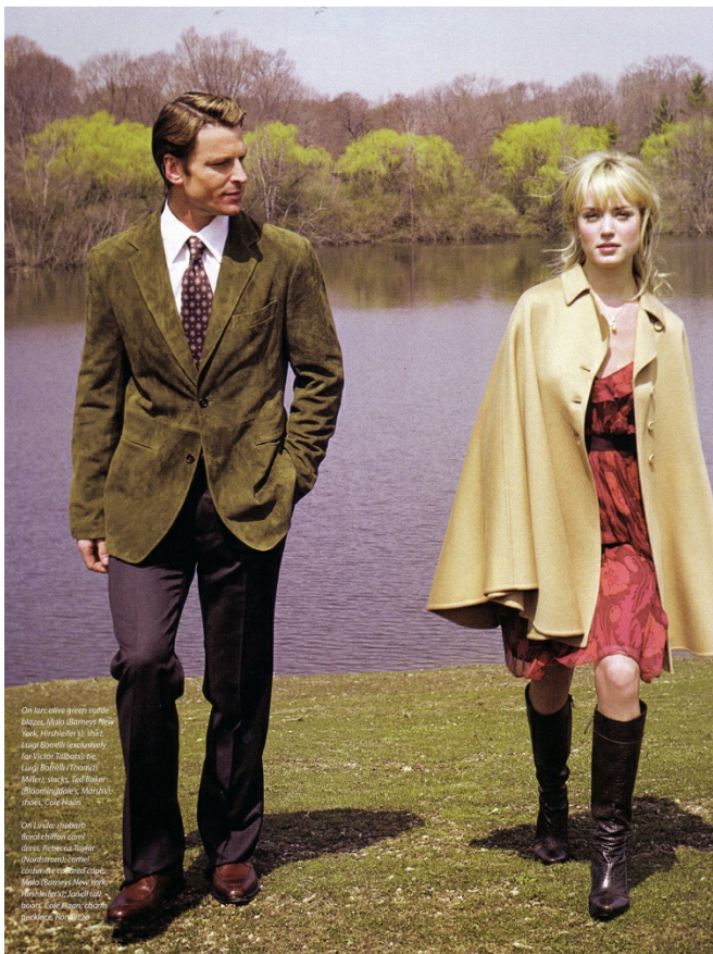
On far: olive green suit jacket, M&S; white shirt, Peter Black (London Jewellery); Luigi Bonelli (celebrity) for M&S; Tibbatts tie; Luigi Bonelli (Thomas Miller); socks, Gal Payer; Blomberg; watch, Metaphor; shoes, Cole Haan On far: London Jewellery; M&S; watch, Peter Black; shirt, Luigi Bonelli (celebrity); M&S; Tibbatts tie; Luigi Bonelli (Thomas Miller); socks, Gal Payer; Blomberg; watch, Metaphor; shoes, Cole Haan