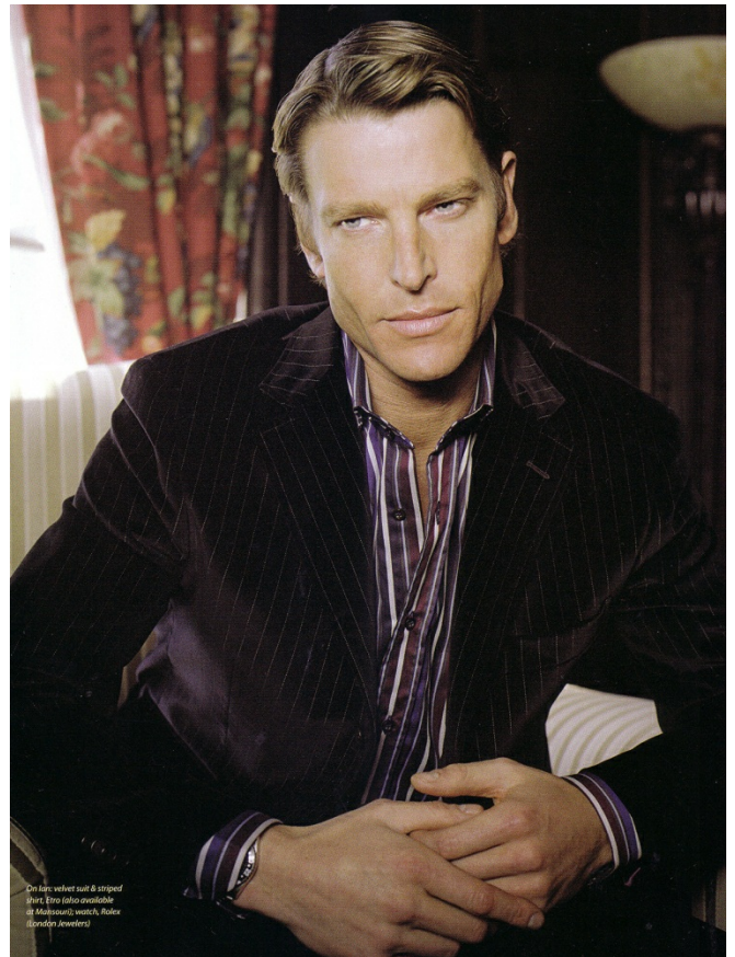
On far: velvet suit & striped shirt, Eiro (also available in Menswear), Roker (London Jewellery)