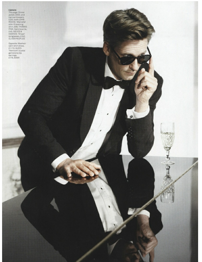
L'Homme The jacket: Dinner jacket, £350 and narrow trousers, £250, both JOHN RICHIE; Marcella shirt, £95; THOMAS PRINCE, shirt, £120; F&S, GIVENS & HAWKES, shirt, £100; HUGO BOSS, £240; OLIVER TOWERS & YOUNG, £240.