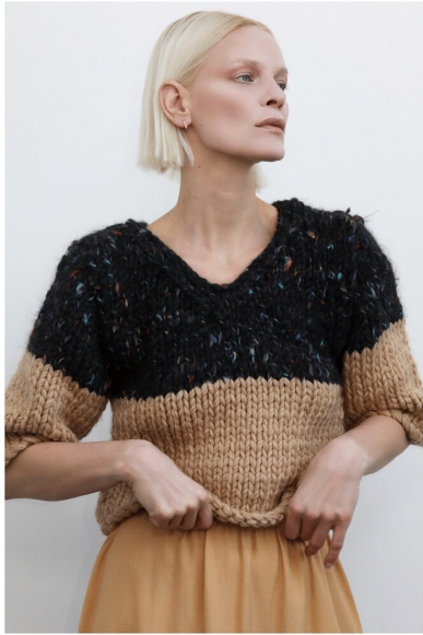
| Stack In The Hay Knitted TEE